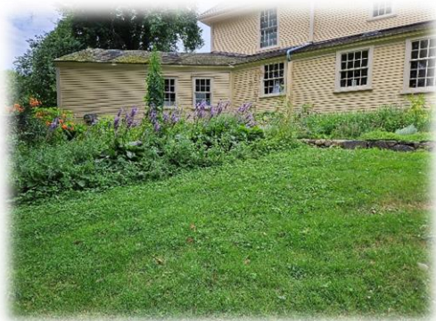
Photos of the garden today.