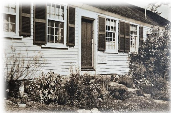
An older photo of the Webster Garden at Buckman Tavern

Carla Fortmann serves as steward of this garden.