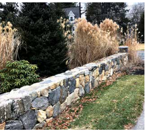
Grasses offer an exciting contrast to the winter landscape.

Tall perennial grasses can create depth and visual interest in your winter landscape. Miscanthus, for instance, remains standing throughout the winter, lending its presence to the garden. Ornamental grasses, with their fluffy foliage, lend a