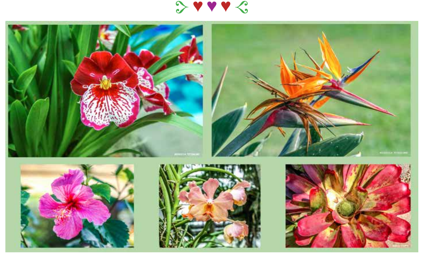
"If we could see the miracle of a single flower clearly, our whole life would change." – Buddha

Friday, March 3, The Well-Gardened Mind at deCordova Sculpture Park 6-7 PM Saturday, March 4, Grow Native Massachusetts Presents We are the ARK 1-2:30 PM