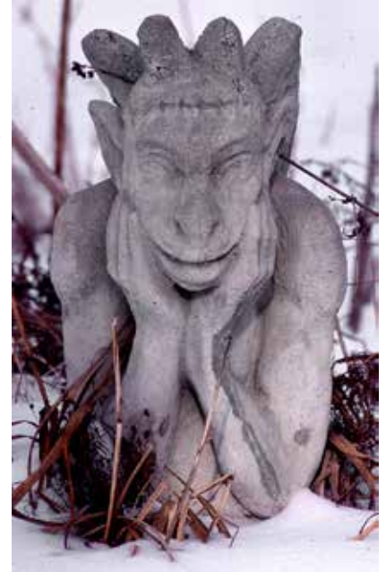
I barely notice this gargoyle in the summer, but in the winter, he's elegant.

There are many options for winter flowers. Hellebores are classic and look lovely in the border, with shades of cream, blush, pink, and green. Heathers, violas, and reblooming irises are good choices. Witch hazel has excellent color, and is another good option for great color.