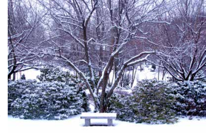
A bench in this garden invites visitors to sit and watch the falling snow.

At this time of year, the bright colors and scents of summer are no longer visible, but my garden